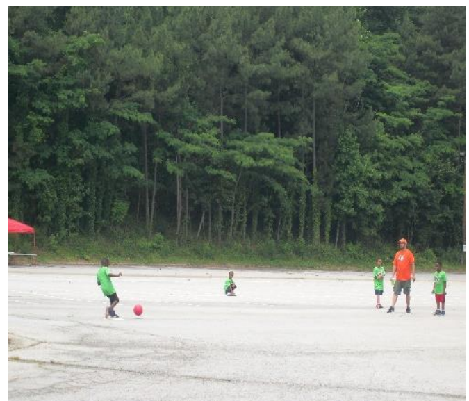
Future Boy Scouts in the Southwest Atlanta District