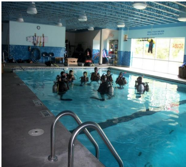
Diving into the Deep Blue Sea

Scouts participated in an exciting beginner's scuba course to learn the basics of this intriguing sport. Scouts learned from trained instructors who taught them how to scuba dive efficiently. The Dive Instructors are located in Flowery Branch, Georgia. The Scouts commented that the course gave them a new interest into scuba diving.