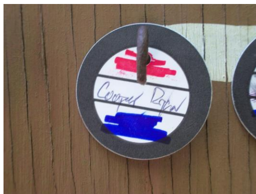
Ryan - Swimmer