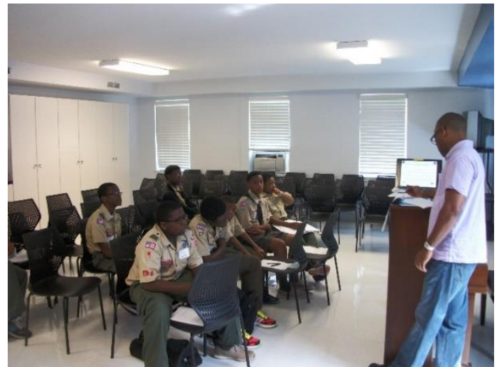
Personal Management- Eagle Merit Badge Class