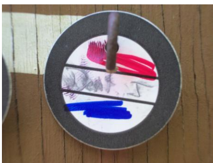
Joshua D- Swimmer