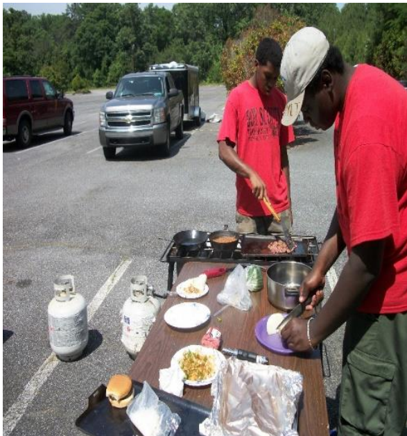
Josh & Josh are Master Outdoor Chefs

one dessert. All of these were to be completed under the old cooking requirement four.