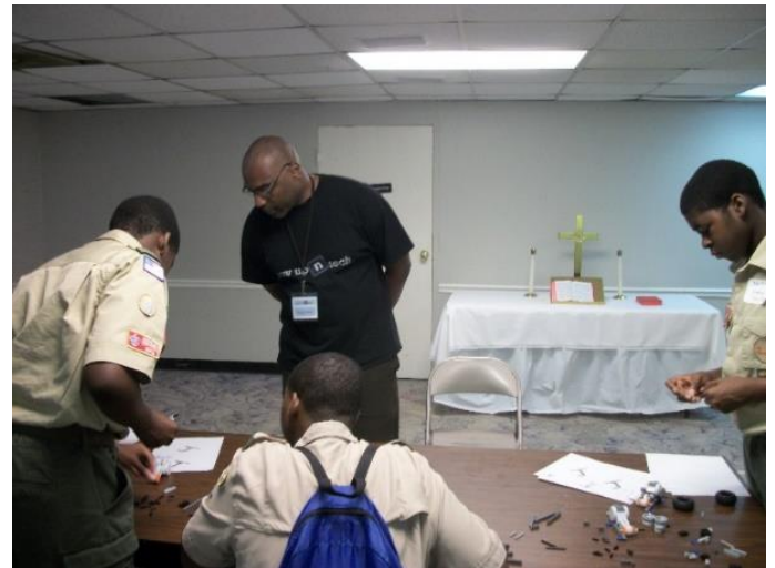
Robotics- Professional Merit Badge Class